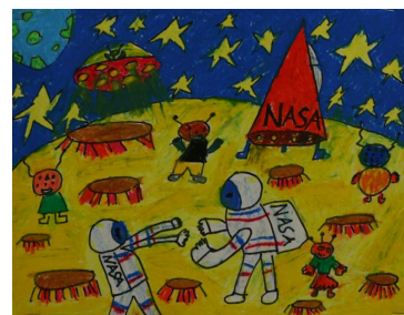
2 nd grade First Place