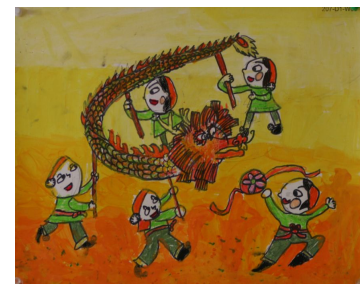
1 st grade First Place