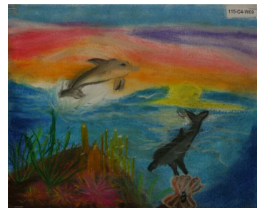
4 th grade First Place