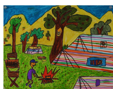
Kindergarten First Place