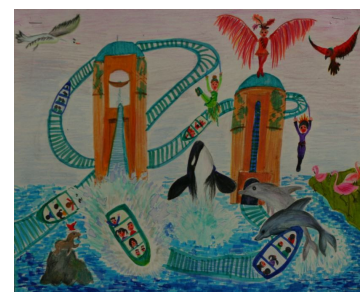
3 rd grade First Place